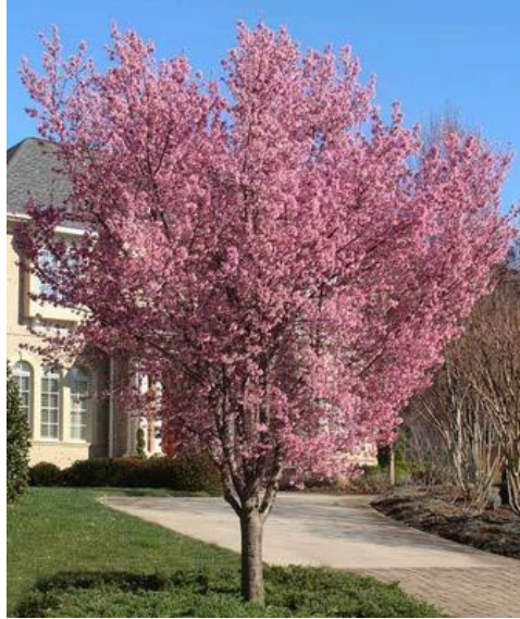
Tree planted will be approximately 9-10 feet tall. Grows to be 20-25 feet tall and 15-20 feet wide.