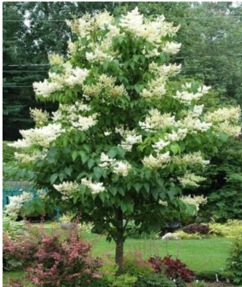
Tree planted will be approximately 7-8 feet tall. Grows to be 20-25 feet tall and 15-20 feet wide.